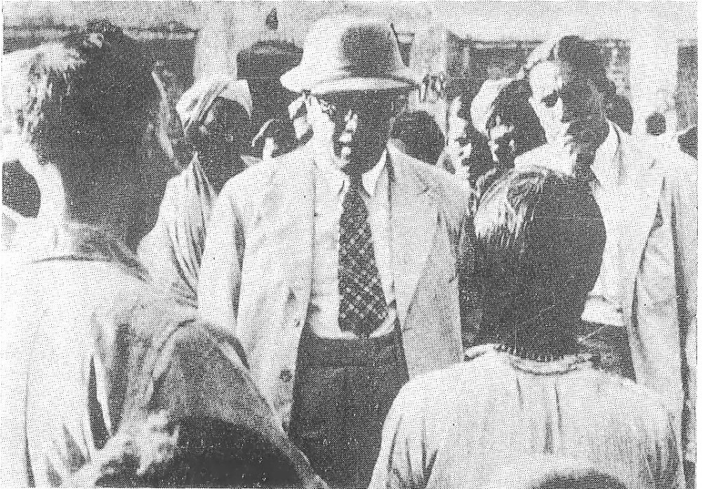
The Hon'ble Dr. B. R. Ambedkar talking to Colliery Labour during his tour of Coalmine areas on December 9, 1943.